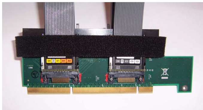
Velcro attached after the P6960 probes are attached

The PCIXRA adapter has four points where P6960 probes are attached. Care should be used when attaching these probes to make sure the attached probes are not pulled away from the NEX-PCIXRA module. After attaching the four P6960 probes the included Velcro strip must be attached to limit the possibility of damaging the adapter or P6960 probes by pulling the attached probes away from the adapter board. Figure 1 is a photo of the PCIXRA adapter with P6960 probes and the Velcro attached. Please note that you do not want to pull the Velcro as tightly as possible since this will pull the probes into the adapter. The Velcro is intended to keep the probes from being pulled away from the adapter and should be installed as shown in Figure 2. It is highly recommended that the user also strain reliefs the P6960 probes so the probes do not put stress on the adapter.