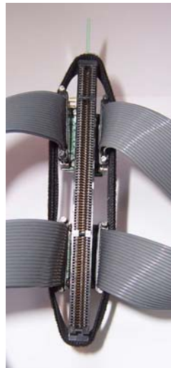
Figure 2- Top view of PCIXRA module with P6960 probes connected and velcro attached

Note the probes are not pulled in toward the PCIXRA module.