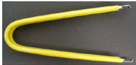
Socket Extraction Tool